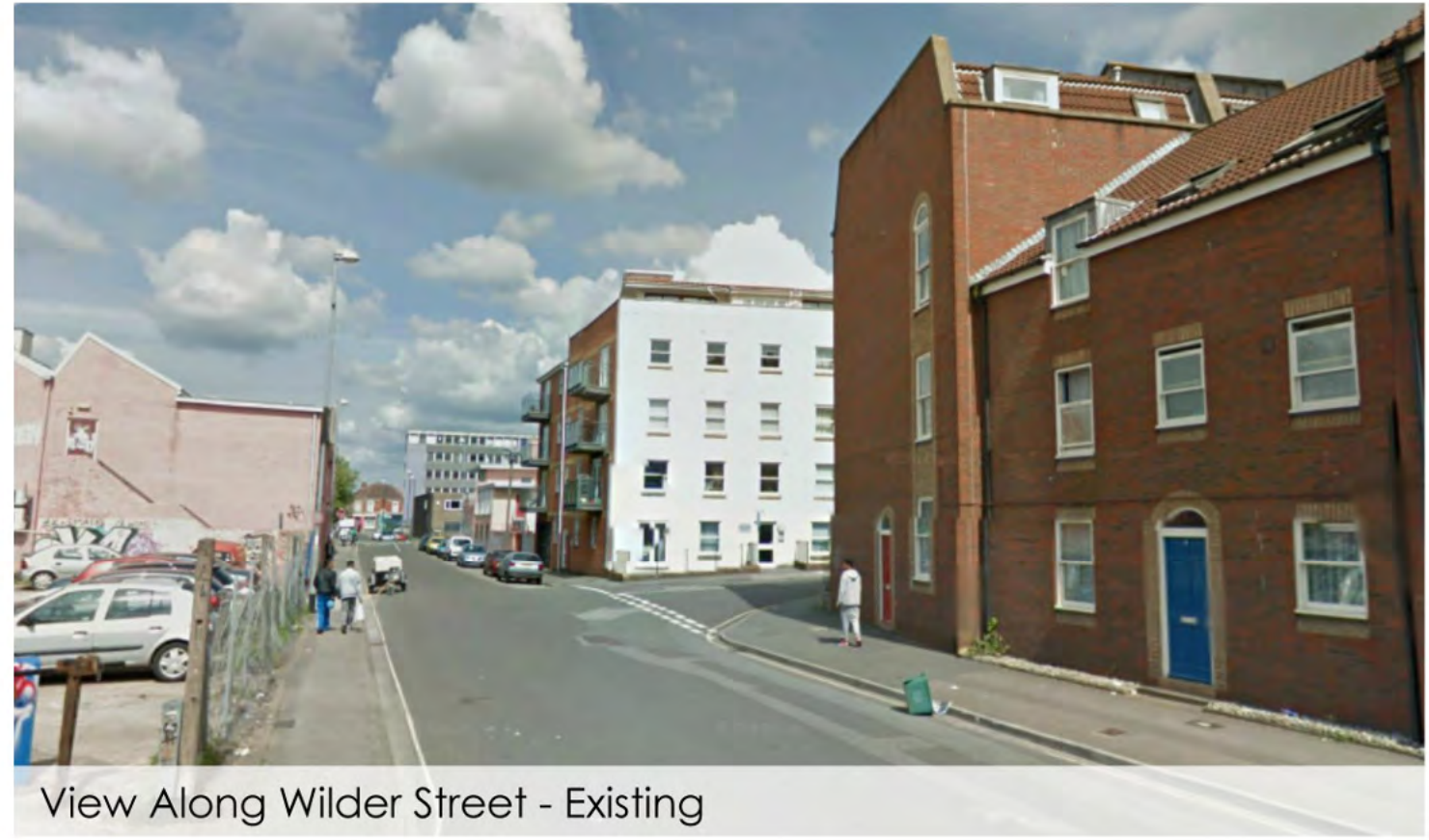
View Along Wilder Street - Existing