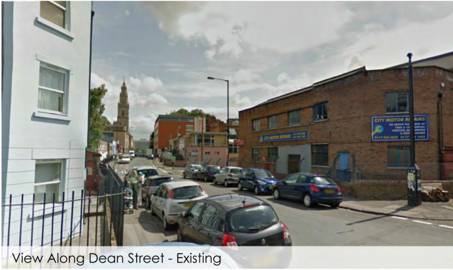
View Along Dean Street - Existing