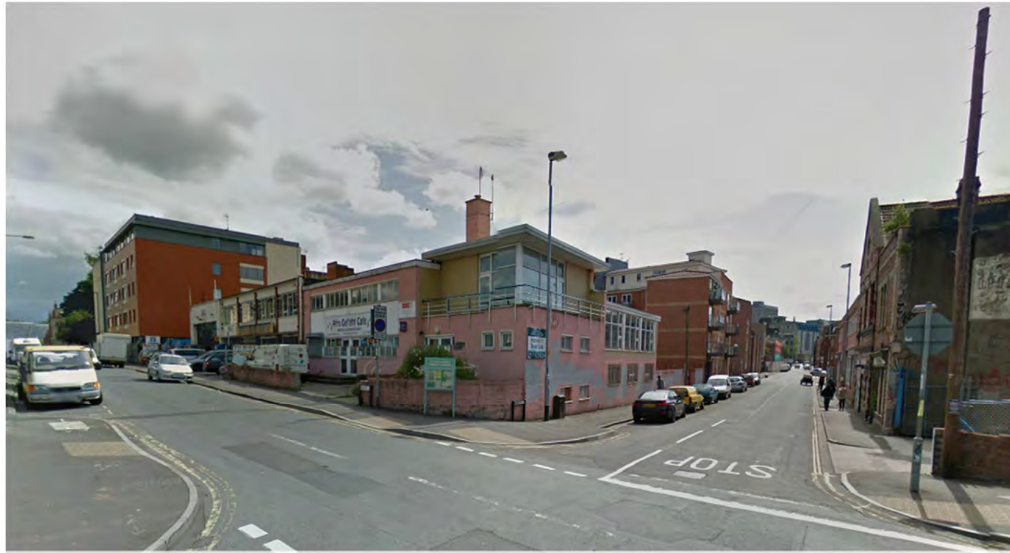
View at corner of Dean St and Wilder St - Existing