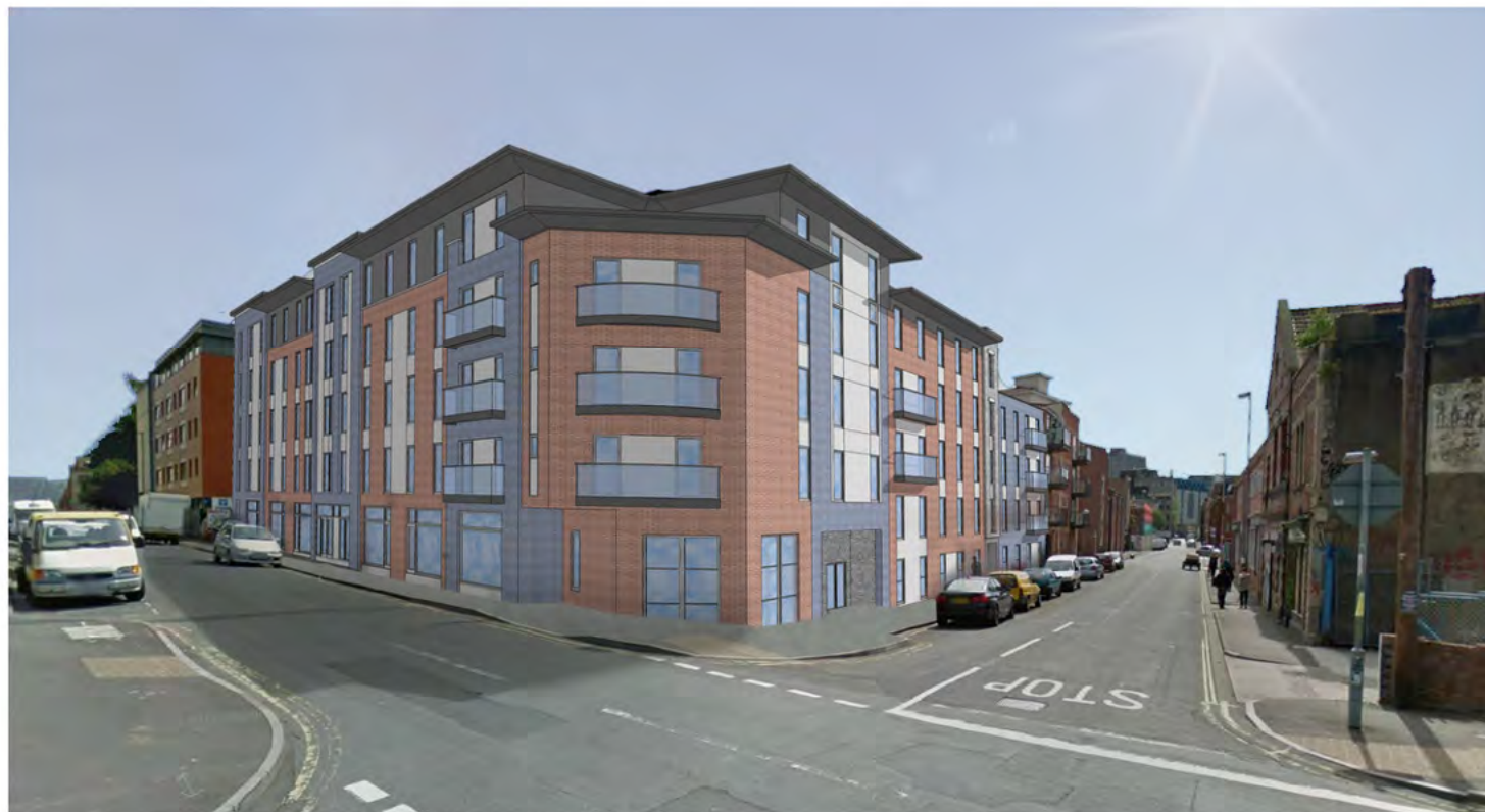
View at corner of Dean St and Wilder St - Proposed