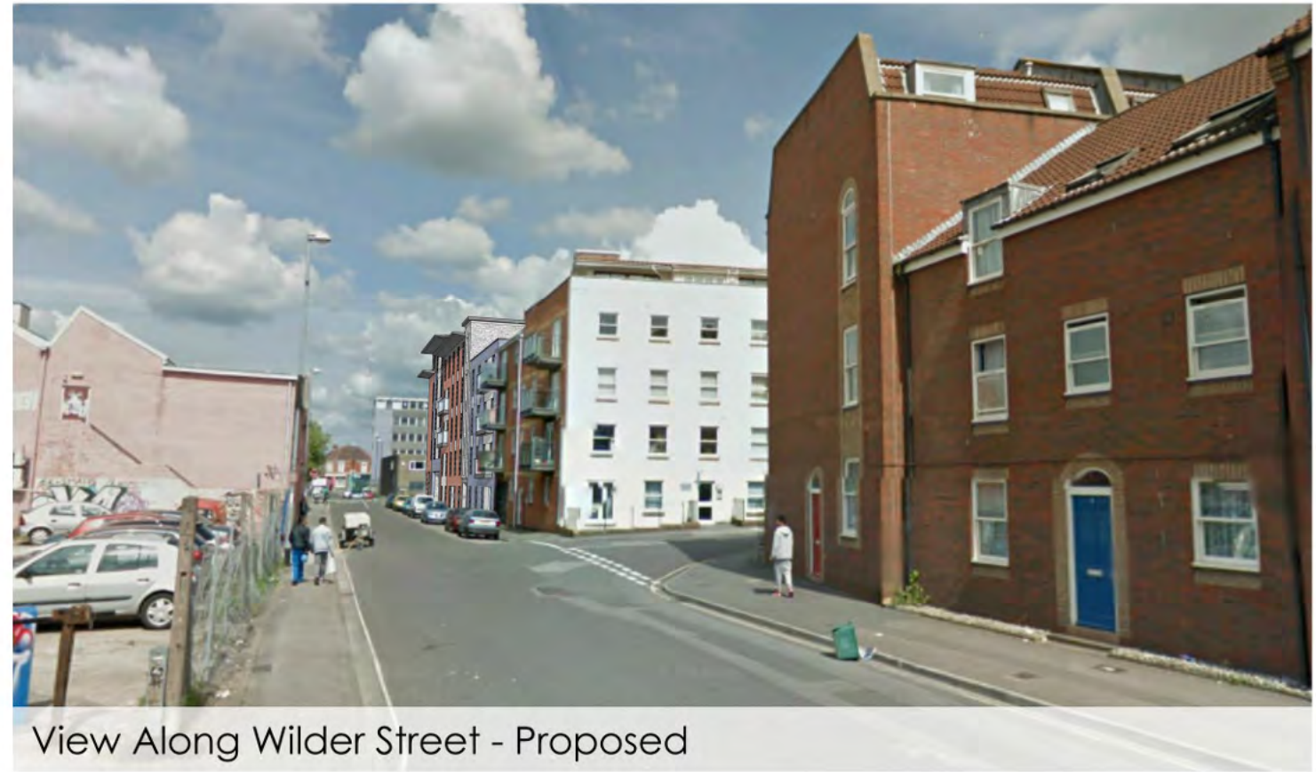
View Along Wilder Street - Proposed