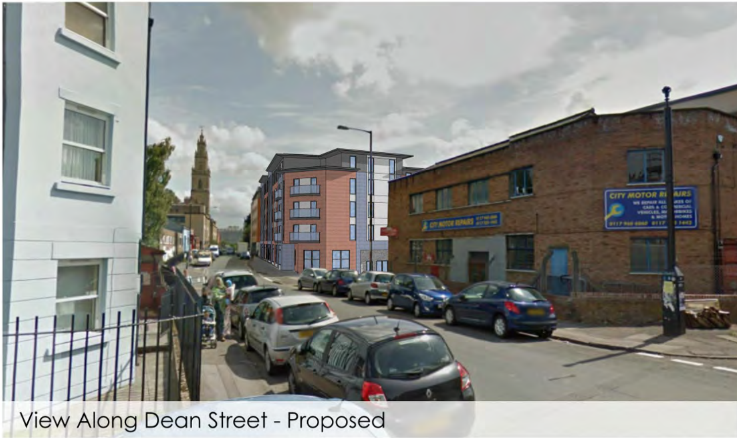
View Along Dean Street - Proposed