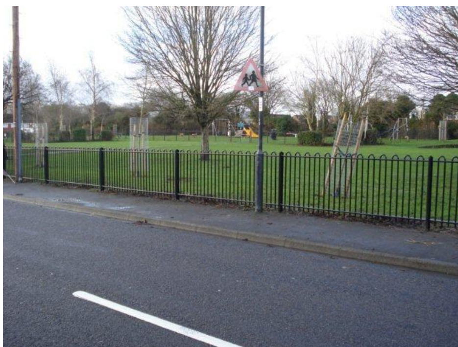
The smart new railings in Headley Lane Park