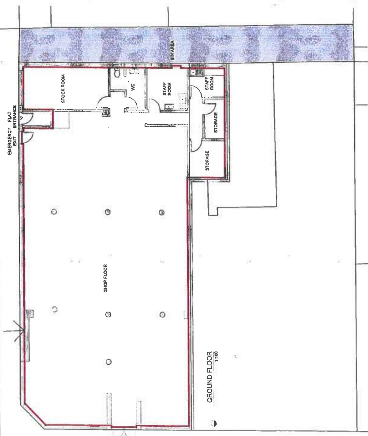
GROUND FLOOR 1:100