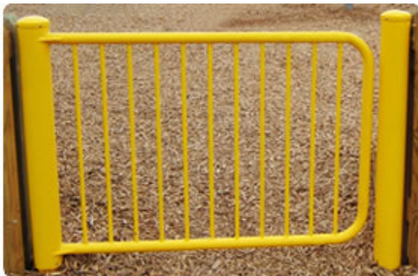
Self-closing gate £1,500.00

The play area will also require a bin, a bench, self-closing gates and safety surfacing.