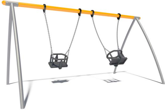
Toddler swings £1,500.00

This would be subject to a design and supply tender with BCC undertaking the installation.