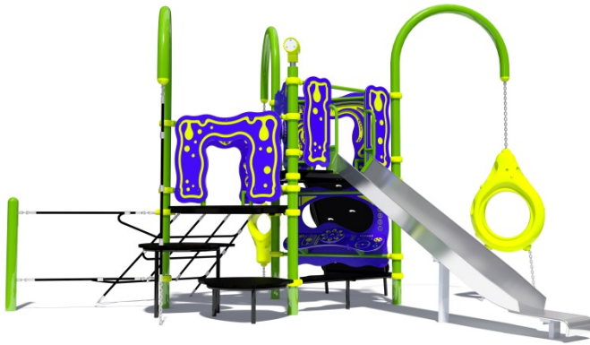
Multi play unit toddlers £9,000.00

Total Costs of Equipment = £10,500 (maybe able to keep the existing sputnik roundabout)