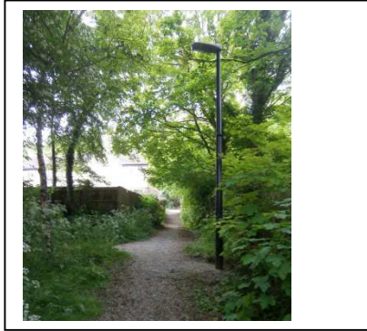
Looking towards Pine Road