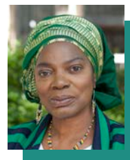
Councillor Asher Craig Deputy Mayor of Bristol