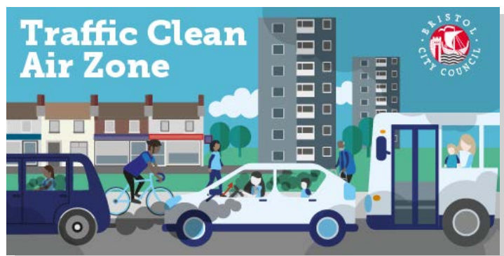
Facebook newsfeed 1200x630px

Throughout the consultation period we will also be tweeting, posting, sharing and re-tweeting posts via Twitter and Facebook. We'd be really grateful if you can share some of the posts and tweets from facebook.com/BristolCouncil and @BristolCouncil