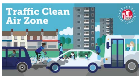
Twitter newsfeed 506x253px