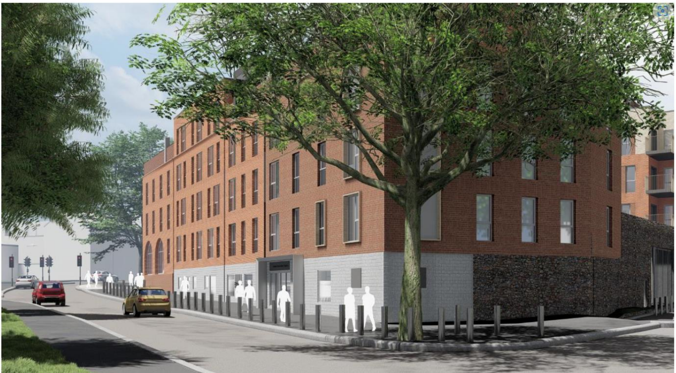
Figure 2 - Proposed 3D Visual Block